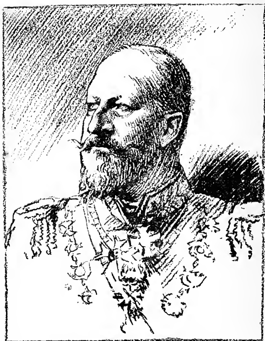
Ferdinand, King of Bulgaria